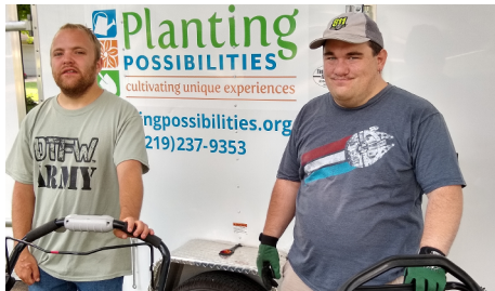
Archive photo from 2019.

Our mowing business needs more lawns to mow! If you live in Munster, Highland, Dyer, Schererville or St. John and are looking for a lawn mowing service, consider Mowing Possibilities. We are competitively priced. Most importantly, we employ three young men who know how to mow, but who have never held jobs before. They are accompanied by a supervisor/job coach who