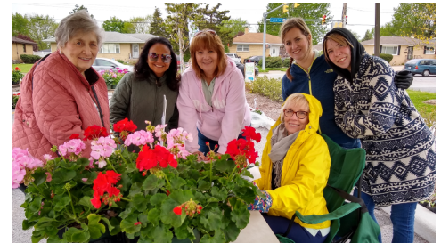
Archive photo from 2019.

Hopefully by May 2021 we will again be able to host our on-site geranium sale with a delivery option. The geranium and heirloom vegetable plant sale is scheduled for May 15. Watch your email and social media for information.