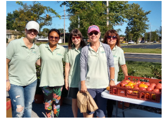
All photos from 2019.