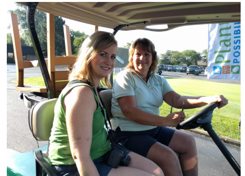
Archive photo from 2019.

We would like to thank all of our volunteers who helped with this virtual event. Thank you to those who organized, solicited donations, and tabulated scores and to the golfers, sponsors, and donors who made this event a success.