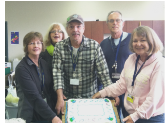
All photos from 2019.