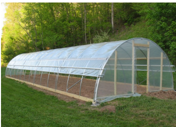
This isn't our hoop house, but it's what one looks like!