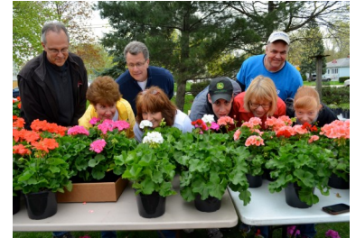
Members of our wonderful team!

As you read through this newsletter, I know it will seem like all I'm doing is thanking a lot of people. Well, that's exactly what I'm doing! There are countless companies and individuals who support us in hundreds of different ways. To each of you, I send a heartfelt THANK YOU! Our success is your success. We are humbled by your faith in us and we promise you that we will continue to earn your support. Know that each and every one is deeply appreciated.